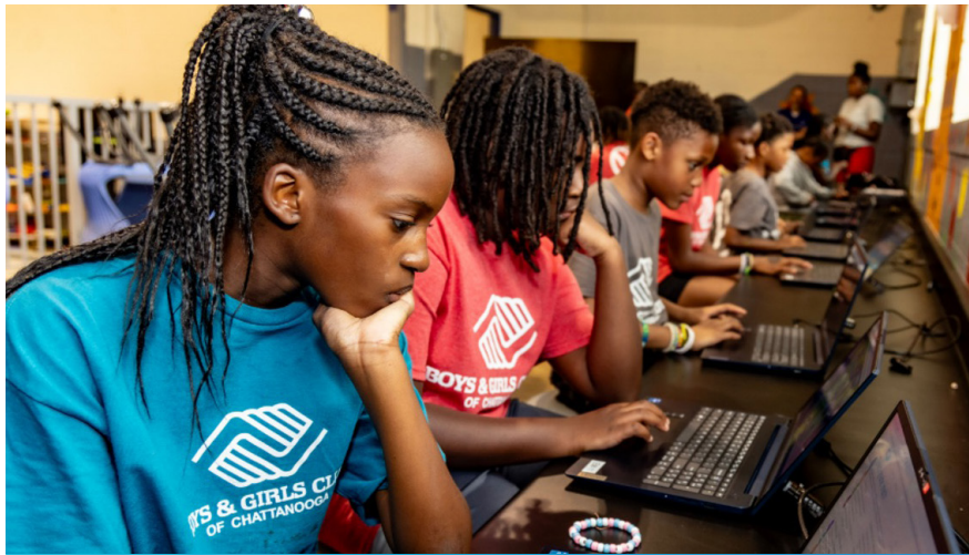
Teen members at the Emma Wheeler Unit work on homework and STEM projects