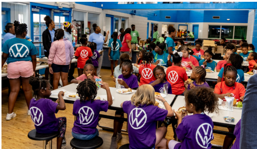
The East Lake Unit serving lunch during 2024 summer camp